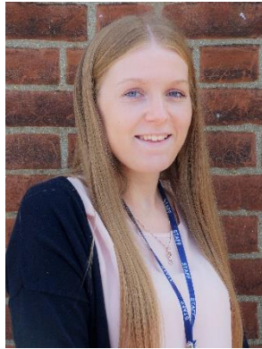
(Parent Support Advisor)